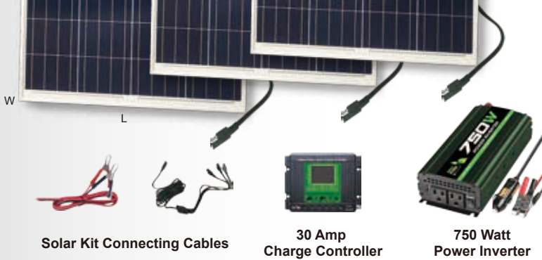
Solar Kit Connecting Cables