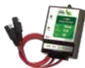
11 Amp Charge Controller