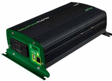
Modified Sinewave Series