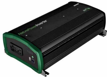
True Sinewave Series

For safe and optimum performance, the Power Inverter must be used properly. Carefully read and follow all instructions and guidelines in this manual and give special attention to the CAUTION and WARNING statements.