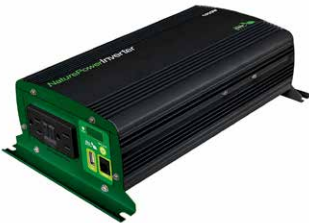
38210 - Inverter 12V 1000W