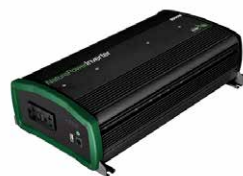
38320 - Inverter 12V 2000W