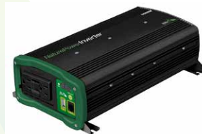
38310 - Inverter 12V 1000W