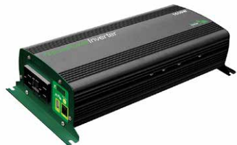
38215 - Inverter 12V 1500W